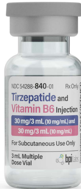
30 mg/3 mL (10 mg/mL) and 30 mg/3 mL (10 mg/mL)