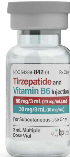
60 mg/3 mL (20 mg/mL) and 30 mg/3 mL (10 mg/mL)