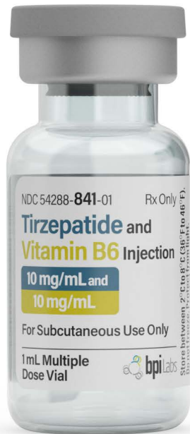
10 mg/mL and 10 mg/mL